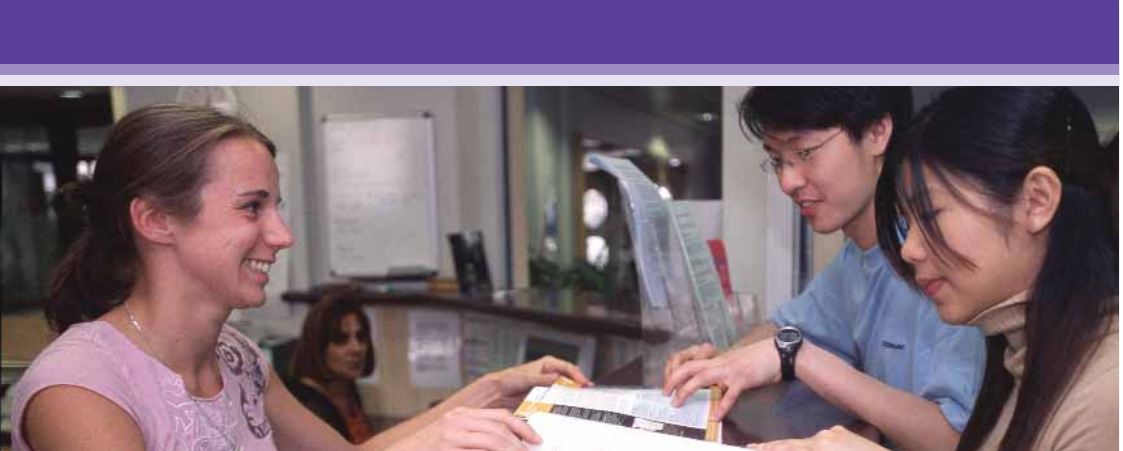
The Student and Academic Services reception desk