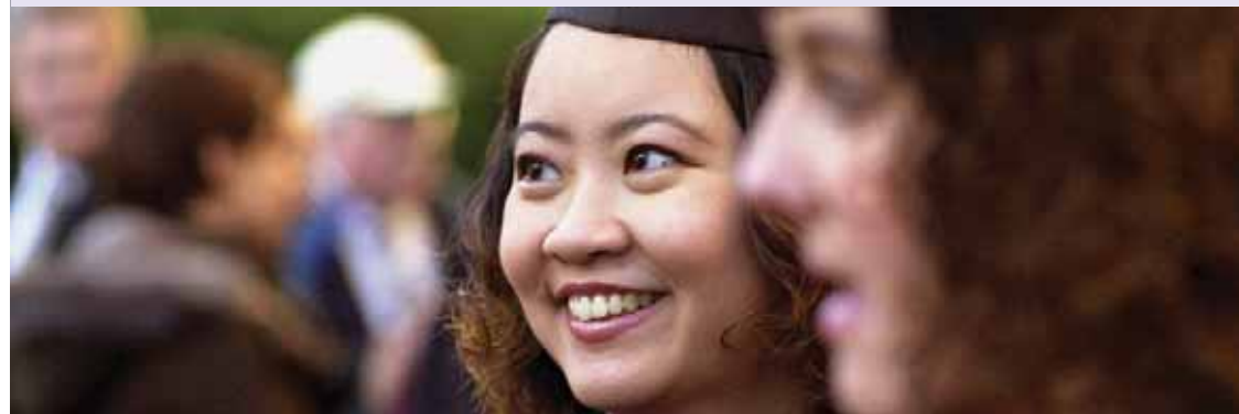
Sheffield Hallam graduates celebrating