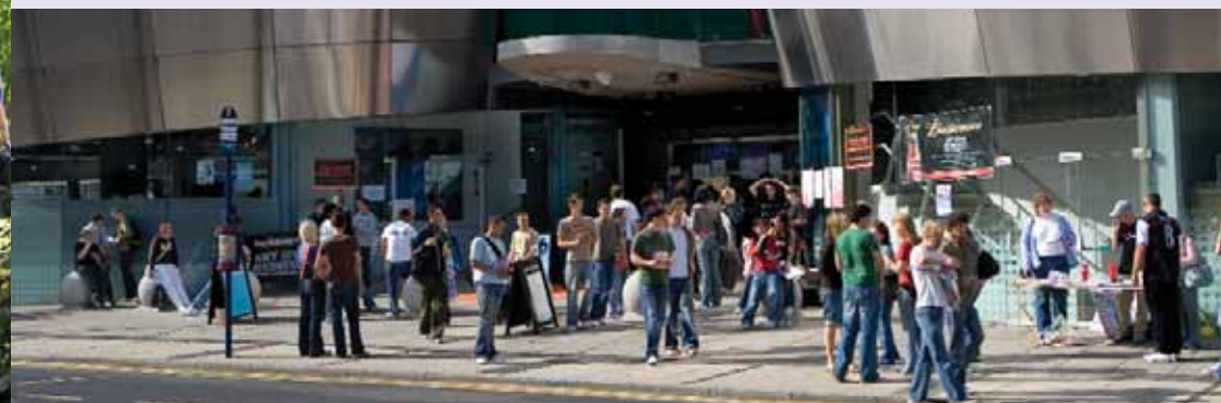
The HUBS (Hallam Union Building of Sheffield)