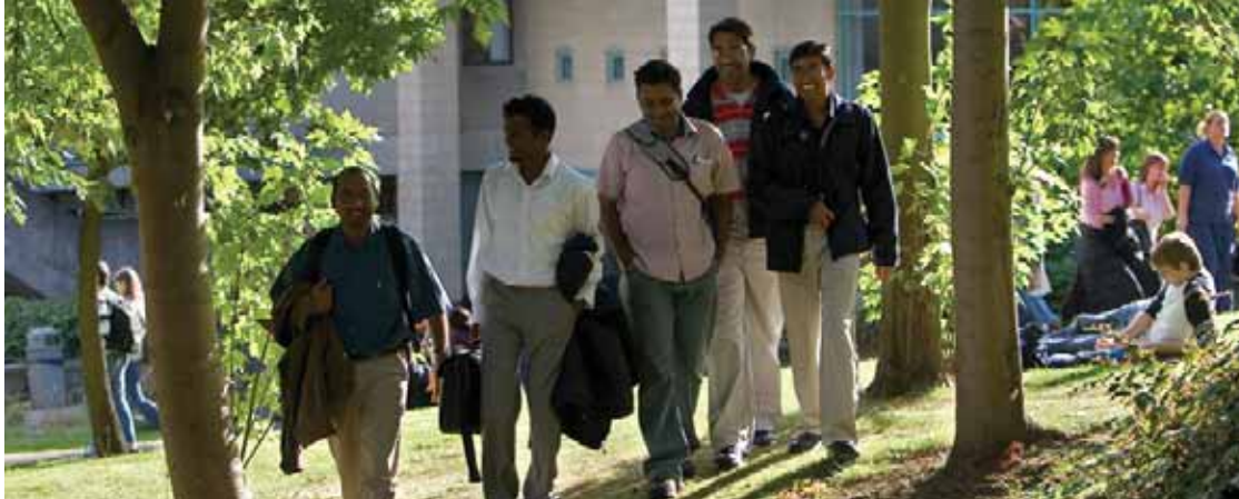
Students at Collegiate Crescent Campus