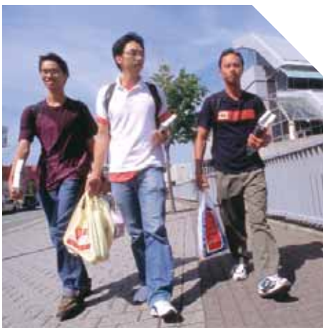
Students return from a shopping trip in Sheffield

You may have to pay for temporary accommodation on arrival. This is approximately £40 - £70 per day.