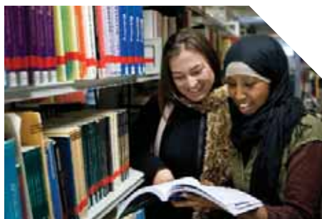
In the library of the Adsetts Learning Centre, City Campus

You can see the University facilities for yourself on the CD-ROM in the inside cover of the International student guide .