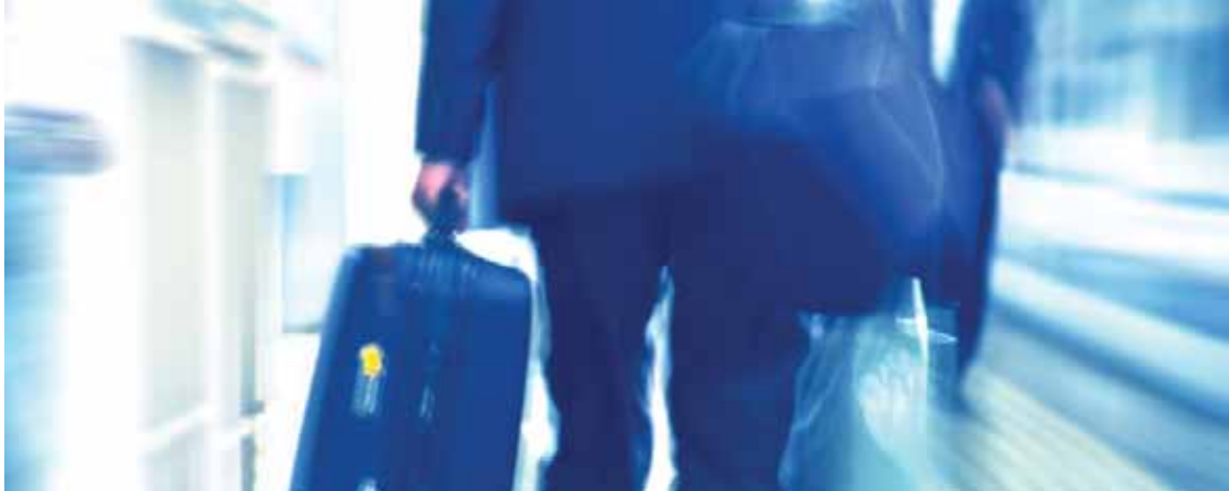
Leaving for the UK