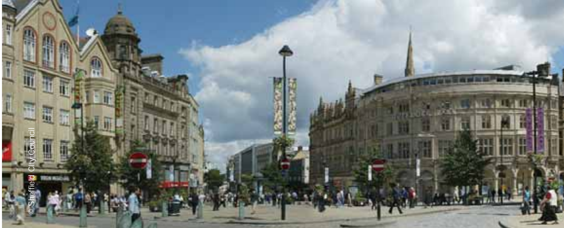
Fargate, Sheffield City Centre