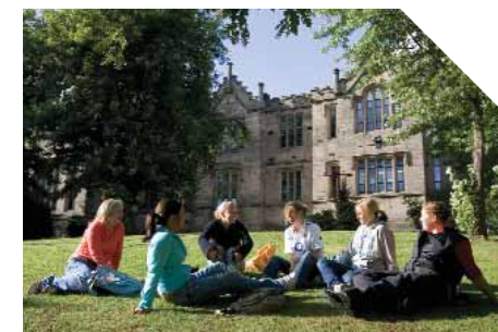
Collegiate Crescent Campus