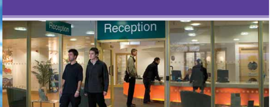
Sheffield Hallam University reception area