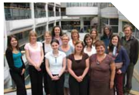
The international team

Please check our website for more detailed information at www.shu.ac.uk/international , especially the frequently asked questions section – www.shu.ac.uk/international/faqs