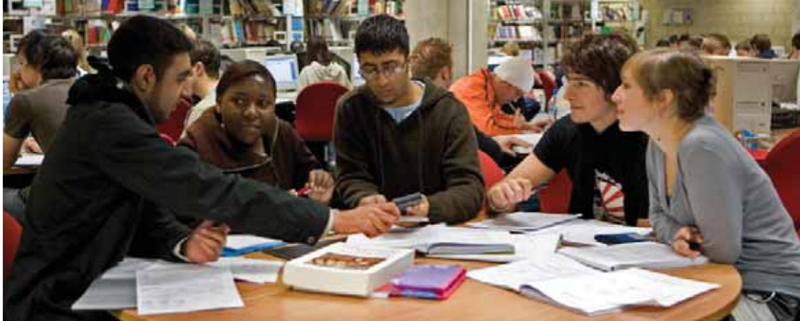
At work in the Adsetts Learning Centre, City Campus