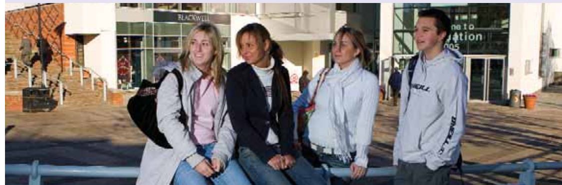
Hallam Square, Sheffield Hallam University