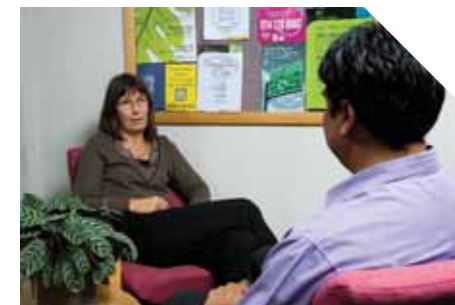
Student and Academic Services provide a professional counselling service for students

If you need help with a disability please e-mail disability-support@shu.ac.uk as soon as possible. Please note that if, as an international student, you need disability support you must pay the full cost of this provision.