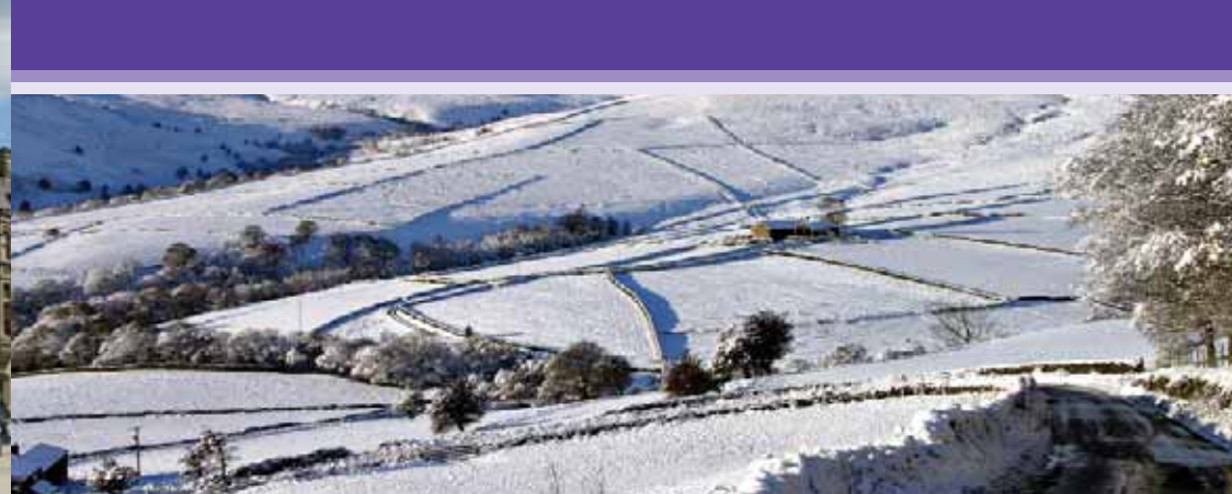
Ewden Valley, north of Sheffield during a winter snowfall