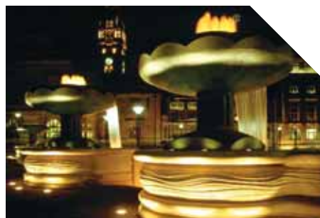
Peace Gardens, Sheffield City Centre